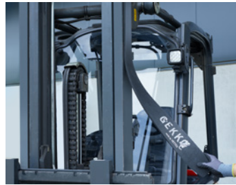
Attach to the lift truck when not in use