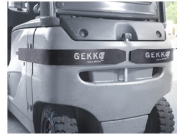
Also applicable as impact protection at the forklift chassis