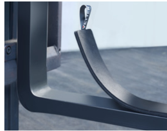
With bracket for an easy take off